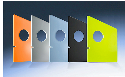
Any color of choice for the Acrylic Glass