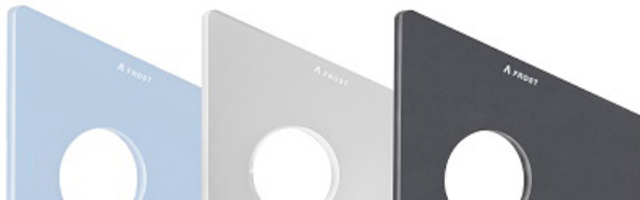
Ice Blue, Clear Frost and Black GT

New 2014! We can alternatively offer You logo print on models from stock with 3-4 weeks delivery time; Clear Frost, Black GT and Ice Blue (Original size) equipped with holder of choice Put together your own personal combination of ice scraper color and hand-holder!